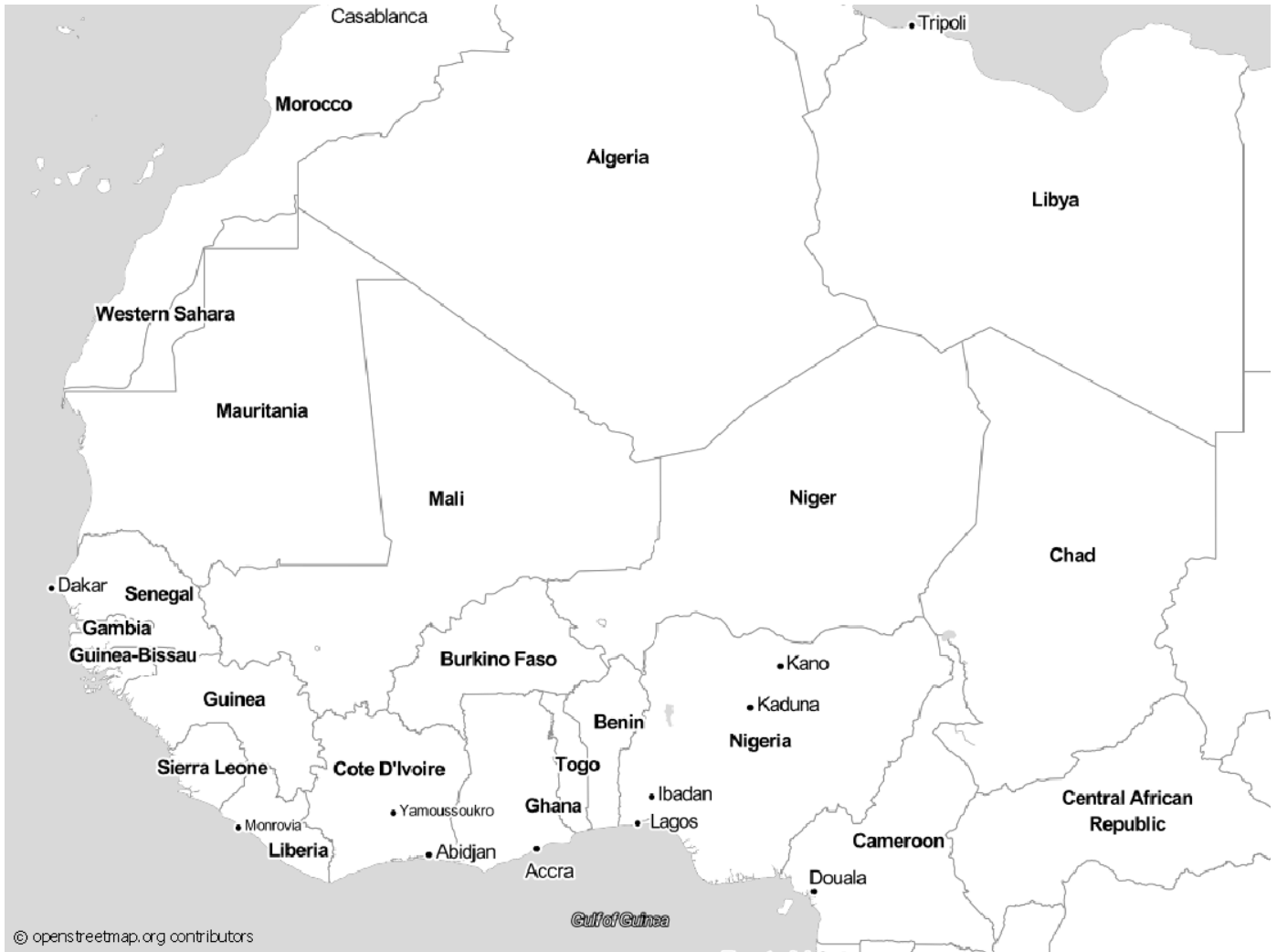
Map of West Africa